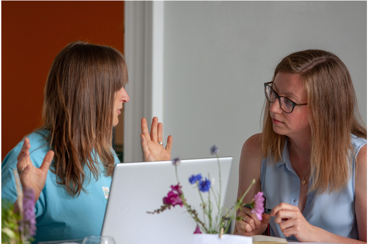
Fig 3. Feedback from participants indicated broad-ranging long-term benefits. ‘I found the AccessLab workshop really useful—it has helped me search for fisheries related projects/research, which I have then taken forward as examples to support investigations which I am currently working on. Delighted to be able to pull a more scientific strand into my investigations.’—Marine sector participant, Penzance 2018. ‘It has definitely made me think differently about academic publishing and how to get my research out there, which I hope will release me from what has been a major (potentially imagined) block to communication.’—Council/Community group participant, Redruth 2017. ‘Working with artists during AccessLab has given me more confidence approaching artists about collaborative work. Primarily, I think, because it gave me a better sense of an artist’s perspective. What they might be looking for in a project, a better understanding of their unique approach and the importance of having such a different skill set.’—Researcher participant, Penryn 2017.

https://doi.org/10.1371/journal.pbio.3000258.g003